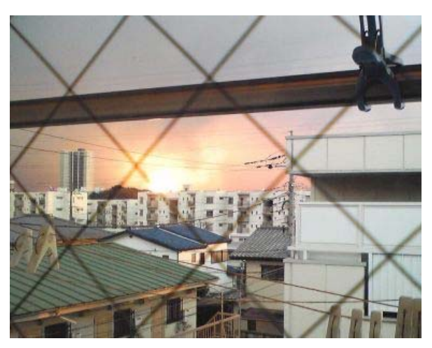
The burning Ichihara oil refinery, Chiba

radiation illness, which a person will get immediately after exposure to very high levels of radiation, and effects which might occur later in life, e.g. cancer. The risk for getting cancer depends on many factors, including the age when being exposed to the radiation, gender, genetic background, type of radiation, dose, dose rate, etc. The risks associated with being exposed to low levels of ionizing radiation is still not totally clear, but if we use the information available from epidemiological studies of the atomic bomb survivors from Hiroshima and Nagasaki, and people being exposed to higher than normal levels of ionizing radiation due to the Chernobyl and other accidents, we can draw some conclusions.