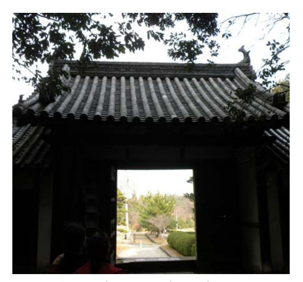
Across the gate and into the sun