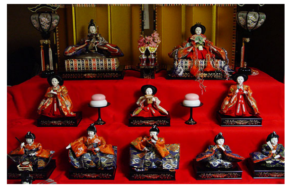
A traditional hina dan

between the Takano and Kamo Rivers to pray for the safety of children. Since fishermen complained about catching the dolls in their nets, the boats are nowadays taken out of the water and being brought back to the temple and burnt.