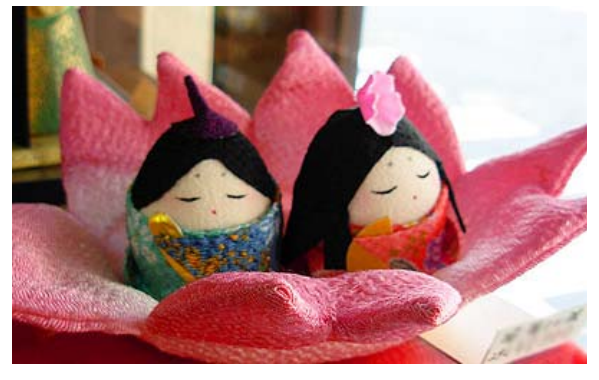
Dairi bina in a peach blossom

The origin of hinamatsuri is an ancient Chinese practice in which the sin of the body and various misfortunes are transferred to a straw doll, and then removed by setting the doll afloat on a boat and sending it down a river to the sea, supposedly taking